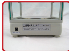
Removable Power Cord